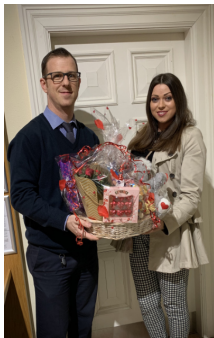
Facebook Valentines Hamper