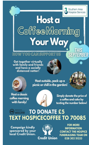
Southern Area Hospice Virtual Coffee Morning