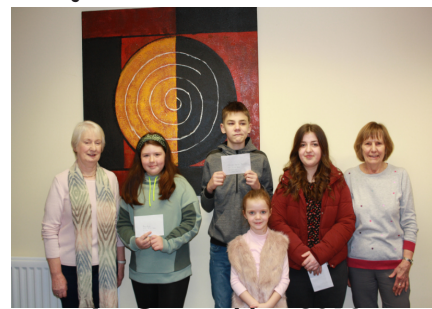
Art Competition 2019