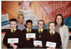
Schools Quiz 2020