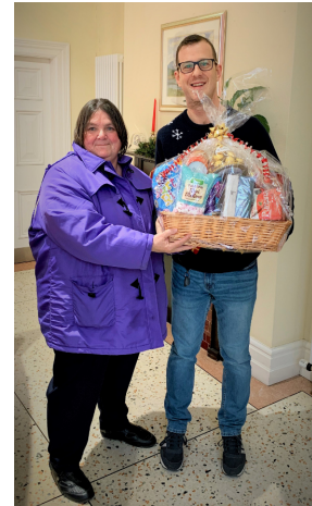
Facebook Christmas Hamper