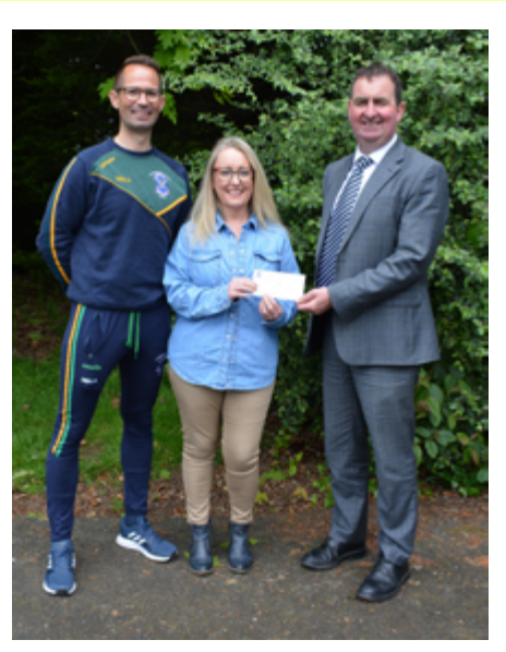
St. Louis G.S. Kilkeel